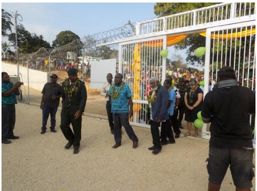
VIPs enter the Centre after cutting of the ribbon