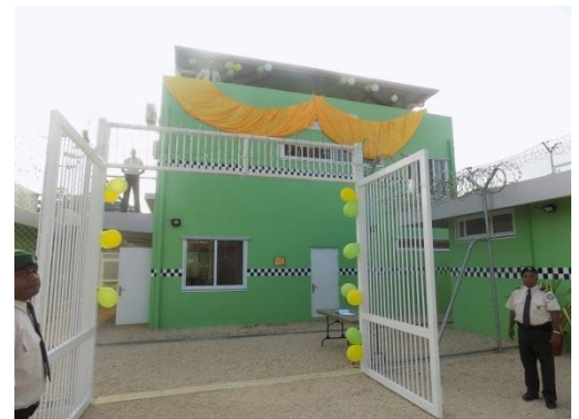
Official Opening of Mauria Correctional Centre