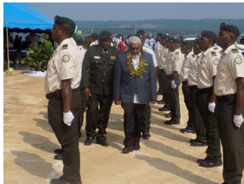
Acting Prime Minister inspecting DBKS guard at Official Opening