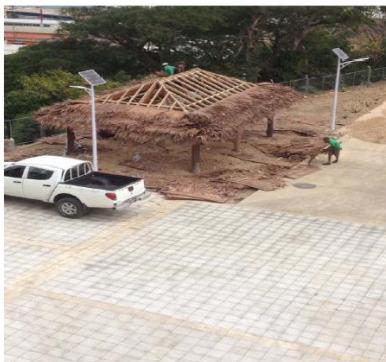
Nakamal under construction

The day ends with a kava ceremony which marks the establishment of the new "Nakamal or farea blong ol Chiefs"