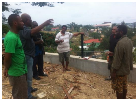
Malvatumauri & Customary officers giving cheers with kava