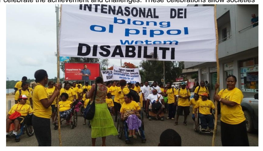
International Day for people with disability Parade to Saralana Park

The main highlight of the celebration is having people with disability facilitate the program for the day. It is also a time where the Para athletes were introduce to the public. The Honourable Jotham Napat was able to donate some sports shoes during the day of celebration.