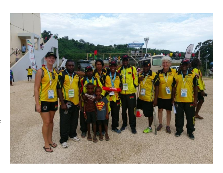
The para athletes team after winning 2 medals in athletics

For the Van2017 Mini games the para athletes had also made an impact to the community to clearly state the important of inclusion in Sports. It is for the first time for Vanuatu to have the highest number of para athletes in this Game. The Disability Desk at MJCS is also encouraging the para athletes and any other person with disability to continue to play sports and continue to use sports as a tool to empowering people with disability in our communities.