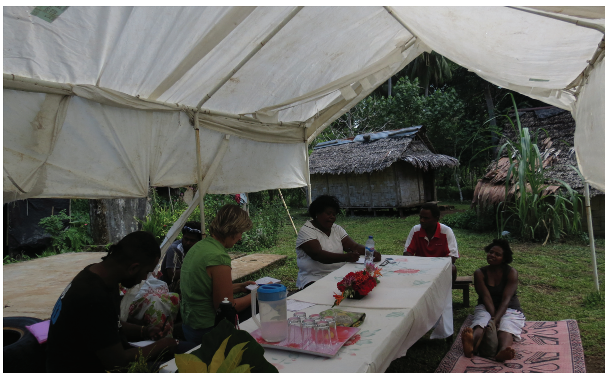
Photo: DWA team working in Santo in preparation for the Family Protection Act pilots.

There have been, of course, challenges and opportunities during this period 10 but some, challenges (other than the impact of Cyclone Pam) have included continued political fluidity; mixed leadership; sensitivity of the work and bilateral relationship and capacity of partners to drive development even where there is the apparent intention to do so.