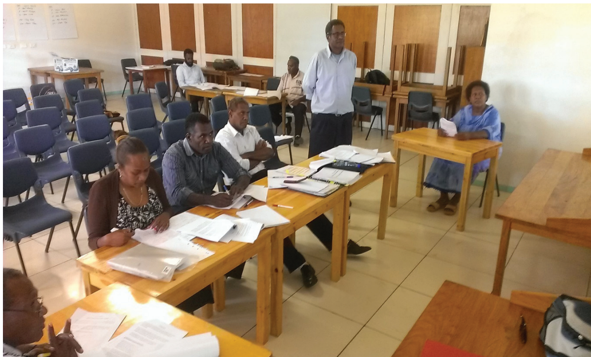
Photo: Lawyers from the sector practice their court skills during advocacy training supported by the Victorian Bar Association

The consequences of the cyclone for SRBJ are described in section 1(b) and should be considered in terms of additional challenges for progress of the program. Notwithstanding these realities, the progress towards achieving outcomes is for the most part on track with manageable delay in the delivery of outputs that are being overcome by concentrated effort in most areas. This is discussed in more detail in section 2(d) and (e). None of the delay at this point threatens achievement of intermediate and end-of-program outcomes 27 although it may have an impact on the depth and sustainability of those achievements at the end of 2016.